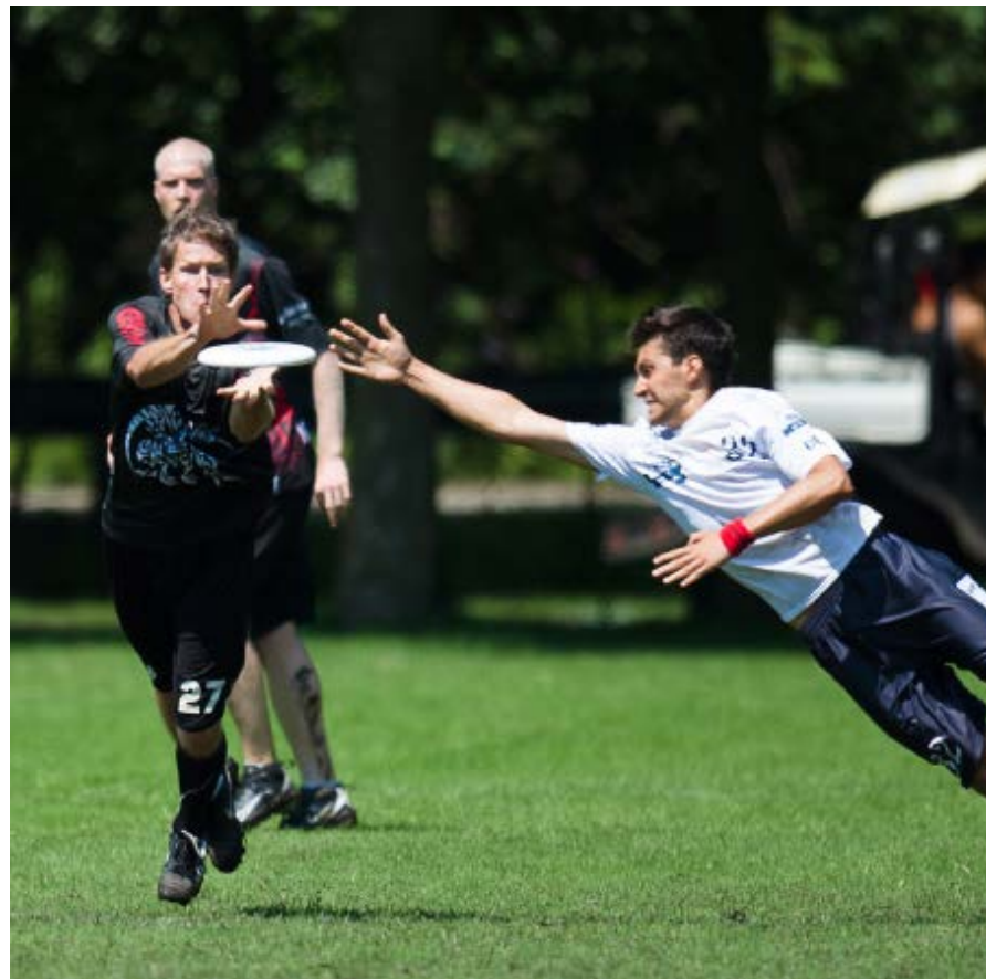
Otso vs Colony