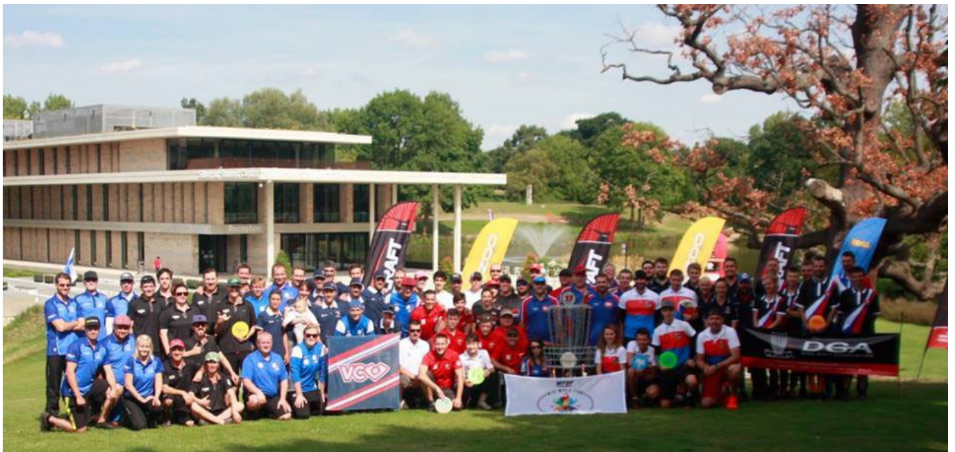
The world's best disc golf teams get ready to compete at the University of Essex.

The climax of this event summed up the whole tournament. From Day 1 there were exciting games, surprise results and exceptional skill on view. Players did their part but there were also some crucial calls from Captains in team selection for each match in each round.