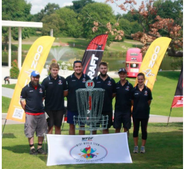
Team Great Britain

With each of the four matches per game worth 2 points - Reigning Champions USA started with a 4-4 draw with hosts Great Britain (GBR). Finland (FIN) then beat France (FRA) 5-3; New Zealand (NZL) took Slovakia (SVK) 7-1; Canada (CAN) lost to an underrated Estonia (EST) 6-2 and Czech Republic (CZE) drew with Croatia (CRO) 4-4. These results did not reflect the final table results until Round 1 was into Game 7 where FIN, EST and CAN became clear favourites moving towards Round 2.